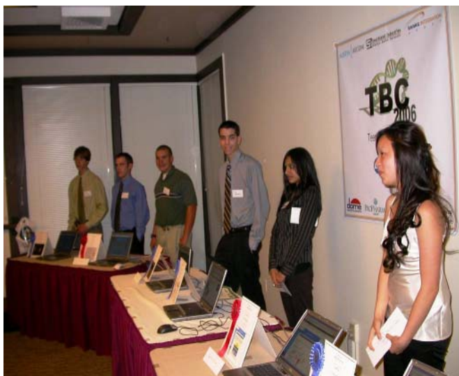
2006 Teen Biotech Challenge winners displaying their biotech web-sites

We are looking for additional sponsors from campus units, industry, etc. and hope to get our DEB faculty and students involved in this outreach effort!