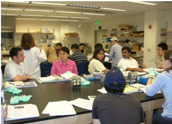
2006 Proteomics Summer Short Course (one of the lab portions)

Full information will be provided on our website: http://www.biotech.ucdavis.edu/SummerCourses/courses.cfm when dates are finalized.